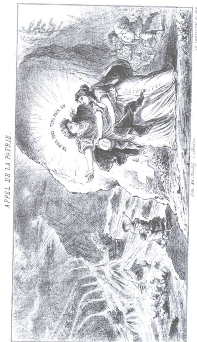
Figure 2 - Engraving "Solidarity"

the victims. Instead, the executive branch of the federal government took the initiative in coordinating the many fund-raising efforts which were made at various levels. Most of the successful organizational innovations which had been attempted since 1806 were implemented again. In the press coverage of his published message, Dubs compared the destructive power of the floods in the country with the attack of an enemy from outside. He pointed out that it should be fought back with the same determination. This metaphor called for a quasi-military mobilization of the country against the forces of nature 46 . The Federal Council singled out the positive effects of the disaster in its address, proclaiming: "Albeit the need is huge, the fraternity is even greater. Taking into account how our ancestors repeatedly succeeded in overcoming worrisome situations, we trust that we will do that once again, today. Therefore, we should truthfully raise our eyes and envisage a better future." 47