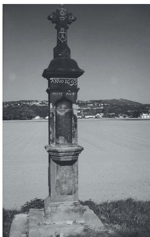
Figure 4: The “hail memorial” in the urban district of Kripp (in Rema- gen, Rhineland- Palatinate, Germany).