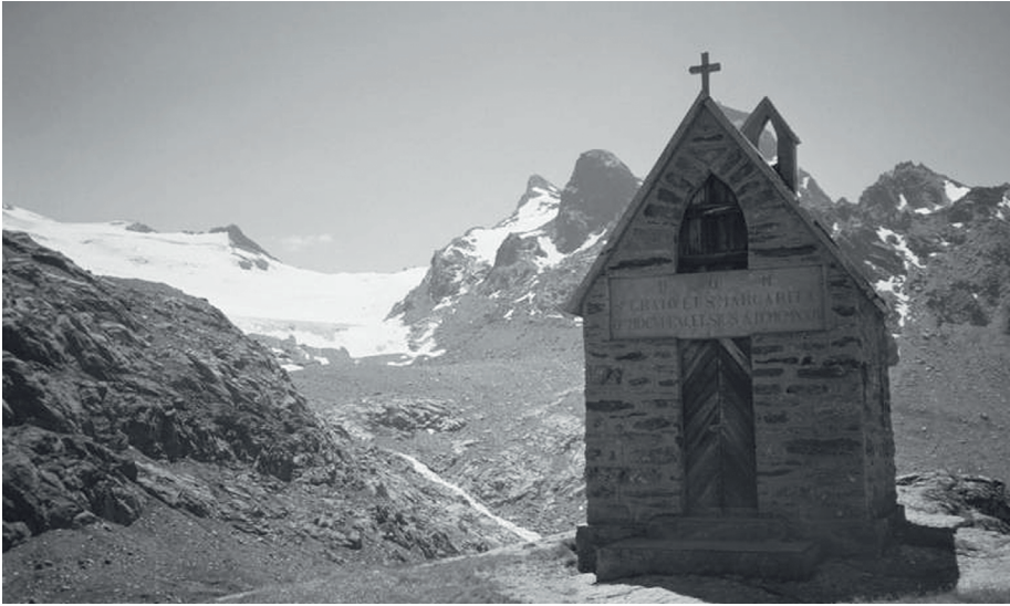
Figure 3: Chapel Lake Rutor, built 1606.