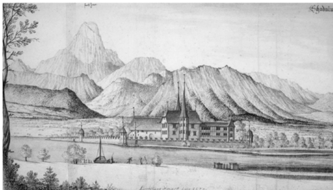
Castle Schadau with the Stockhorn Mountain Chain in the Background, Water Color of Albrecht Kauw, 1672 (Bernisches Historisches Museum, Bern)